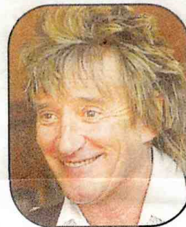
Rod Stewart will be 64 on the 10th.

Jupiter, in your house of love and relationships, continues to influence your life, and its